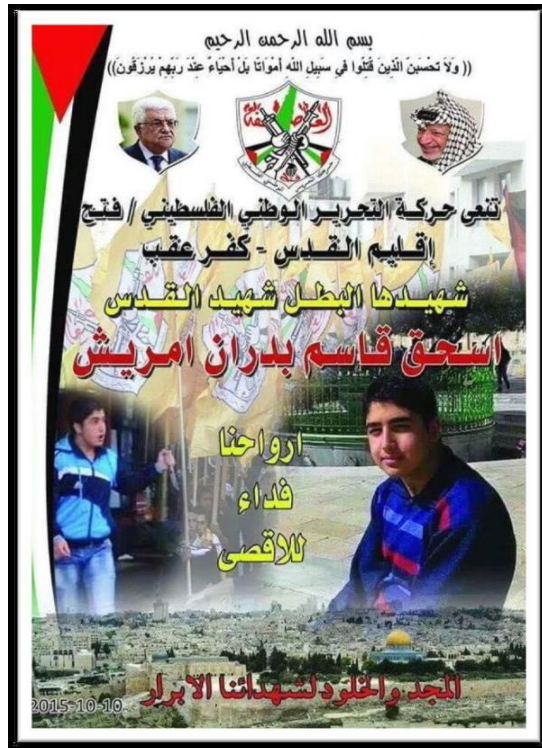
A social media graphic praising terrorists who stabbed Israelis.