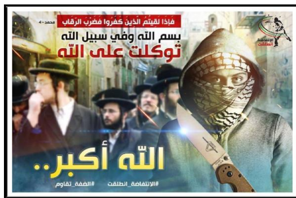
A social media graphic calling for the stabbing of Israelis.