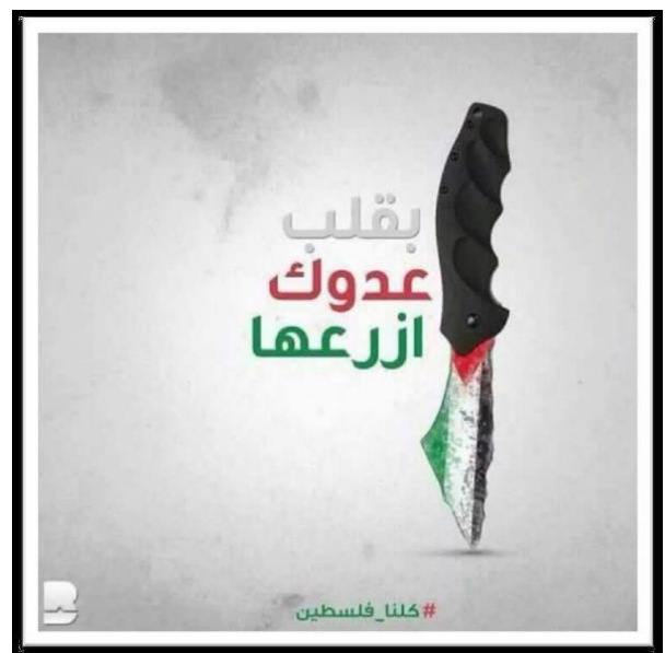
A social media graphic calling for the stabbing of Israelis. The graphic states: Stick your knife in the heart of your enemy.”