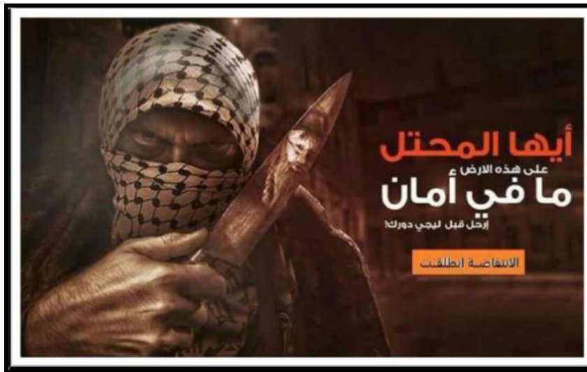
A social media graphic calling for the stabbing of Israelis. The graphic states: “You will not have security anywhere. Go away before your turn to die will come.”