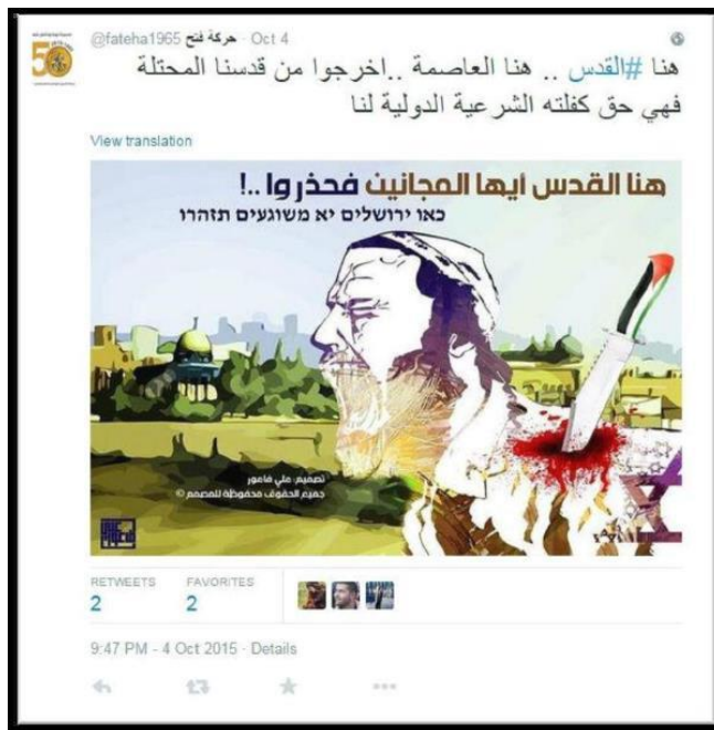
A social media graphic calling for the stabbing and murder of Israelis.

The United States must urge Palestinian leaders to do their utmost to quell this incitement. Palestinian Authority President Mahmoud Abbas has exacerbated tensions with inflammatory remarks about the peace process and the Temple Mount. Instead, he must try to end incitement to violence, condemn the recent wave of attacks, and resume direct peace negotiations with Israel.