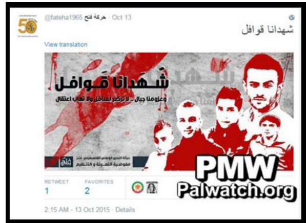
A social media graphic praising terrorists, who between them killed two Israelis and stabbed seven more. The graphic says: “Our Martyrs [come] in droves our determination is [like] mountains, it does not bow down before the despicable and does not fear arrest.”